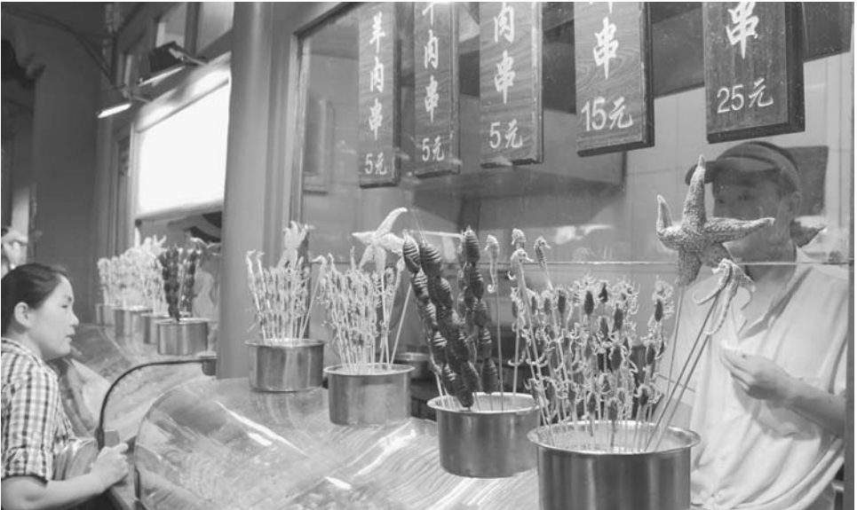
A vendor on the night food market in Beijing sells fried silk worms, sea stars, scorpions, and sea horses.

The Chinese people are mainly one ethnicity, called Han, but within the country are nearly 60 ethnic groups, all speaking different languages. Even within the Han, there are multiple languages and different customs. Because so much of Chinese culture is centered on food, differences among peoples are often expressed in that idiom. Northern Chinese, who come from regions less rich in diverse foods than the south, say that the Cantonese will eat anything with four legs except a table.